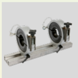
Restraining and alignment equipment