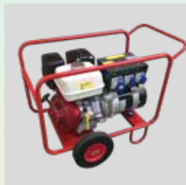
Generator of suitable size to power control box - refer to manufacturers' literature for power requirements