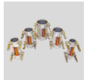
Re-rounding clamp if pipe has become oval or has a flat spot