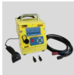
Electrofusion control box with appropriate leads