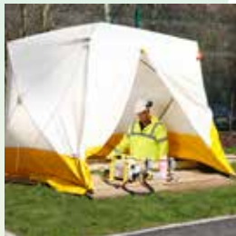
Welding tent/shelter and ground sheet